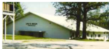
● Manville Camp Tabernacle

impression as you drive toward the main lodge area.