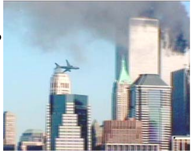
2nd airplane to hit World Trade Center, 9/11/01.

Many people will be assembling together for this Day of Trumpets (usually called “Rosh Hoshana” by Jewish people) this Tuesday, September the 18 th . This day has been observed by some Christians for nearly 2000 years and some Jews for nearly 3500 years. It represents a time of warning for what is to come—a chance to repent and a chance to make a